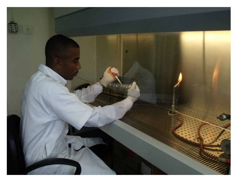
Above: A Laboratory Technologist at work

In clinical practice in Jamaica, many veterinary clinic assistants are trained by their employing vets themselves in animal restraint, basic clinical assistance procedures, patient care and monitoring. And mention must be made of the non-medical support staff – managers, administrators, secretaries, receptionists, attendants, drivers, all of whom make their contribution to the delivery and sustenance of veterinary services.